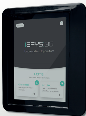
Intelligent user interface

The AFYS3G Information Marking System Lambda768 has a gripper arm that selects one tube from the rack and carries it to the camera. The camera then detects the laser-friendly part of the tube, which tells the gripper arm how to position the tube in front of the laser. After the tube has been positioned, the laser etches a permanent marking directly onto the tube's surface. The gripper can rotate the tubes to engrave on multiple sides.